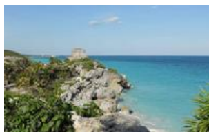
Beyond Cancun, a quiet